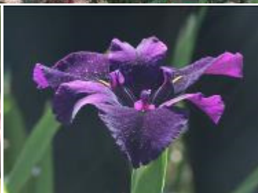
'Black Gamecock' (F. Chowning 1980)

bearded irises such as 'Csardas Princess' (J.D. Crump 2013) and 'Domino Noir' (R. Cayeux 2012) growing well in the shade, and 'Daring Deception' (T. Johnson 2012). Not only were bearded irises present but beardless as well. Louisiana irises such as 'Black Gamecock' (F. Chowning 1980), and 'Hush Money' (M. Dunn 1998) were also giving a