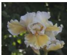
'Countess Markiewicz' (J.G. Crump 2016)

The Bray Garden, even with the presence of others enjoying it with me, was a wonderful place for a peaceful interlude. Returning to the front garden area, I sat on the porch to give judges training and enjoy the sights in front of me. This garden was a perfect place to train new judges.