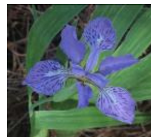
Iris Tectorum in Bray Garden