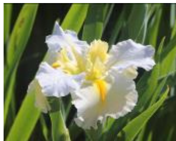
'Hush Money' (M. Dunn 1998)

Along the opposite side of the house was a path through a shaded garden that included both purple and white Iris tectorum , an unnamed species cross, and some spurias that were unfortunately past bloom. Among