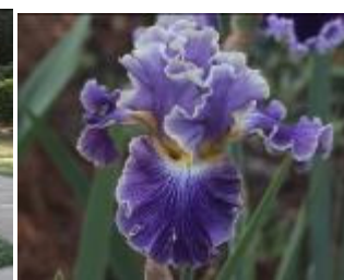
'Belle Fille' (M. Smith 2015),