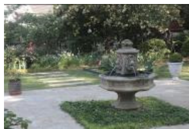
Fountain in Bray rear garden